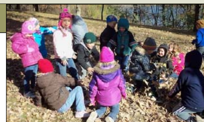
Kindergartners visit Fontana!

We look forward to seeing the play, "The Boy Who Cried Wolf", at the Williams Center, in Oelwein, November 15th. What a great opportunity to see a Gallagher-Bluedorn play in our area!