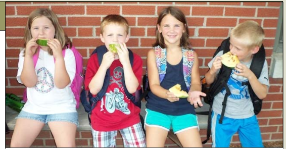
1st Graders enjoy watermelon from the school garden!

Watermelon were harvested from the Farm to School garden and brought to school by Joe Olson. First graders seemed to enjoy this delicious snack. We hope maybe a few seeds found their way home in some pockets! (Be sure to put them in a safe place and plant them next spring!)