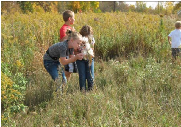
2nd graders examine things found in the Prairie.

With fall upon us, the weather is forever changing. Please make sure that your child is dressed properly for the changing temperatures, and be looking soon for information about upcoming Halloween parties in each classroom.