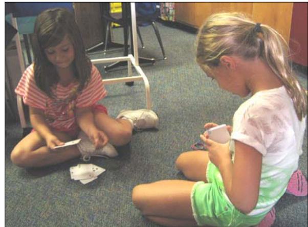
2nd graders use cards to learn in Everyday Math!