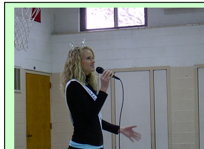
Miss Iowa sings for West students

Miss Iowa did an outstanding job and reemphasized the message of character.