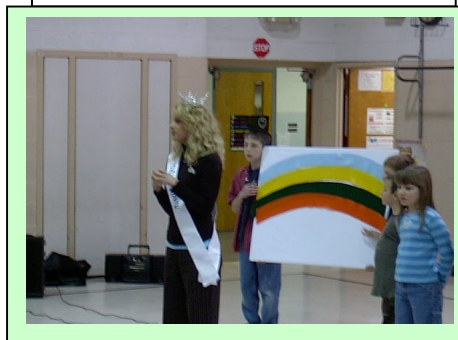
West students learn the meaning