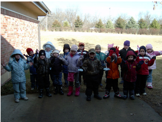
Kindergarten is wondering, "Where is the snow?"

Students are growing and learning to manage their own work habits (working independently, following directions & using time wisely.) Academic skills will focus on letter & sound relationships to build early reading skills as well as develop our abilities to write our ideas. Number readiness (counting, naming and writing numbers to 20) is also an area of emphasis. Kindergarten students are looking forward to celebrating 100 days of school this month (if we don't have too many snow days!) We will participate in many activities involving 100.