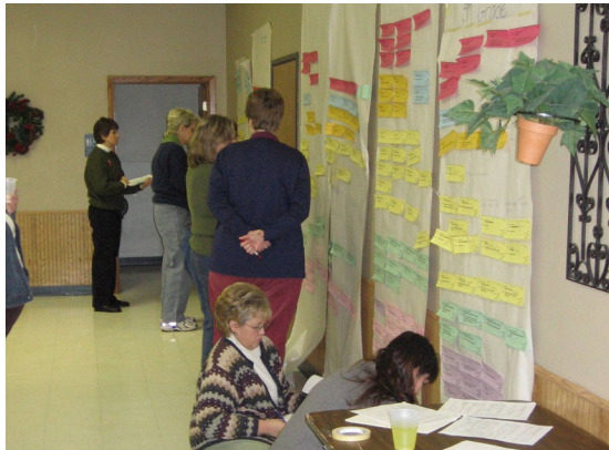
Above – Members of the K-5 Language Arts Subject Area Committee analyze the wall for possible gaps and/or overlaps in their curriculum.