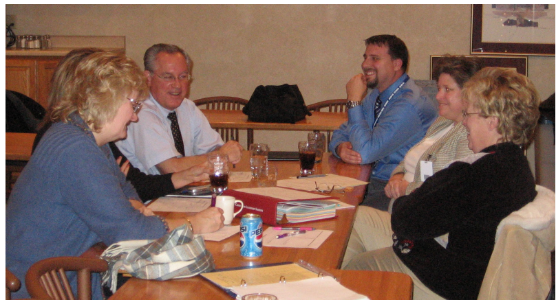
CCC discusses issues in one of the Focus Group meetings